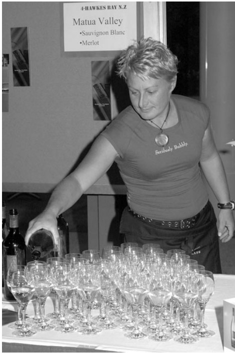
Hawkes Bay NZ Wine Tasting