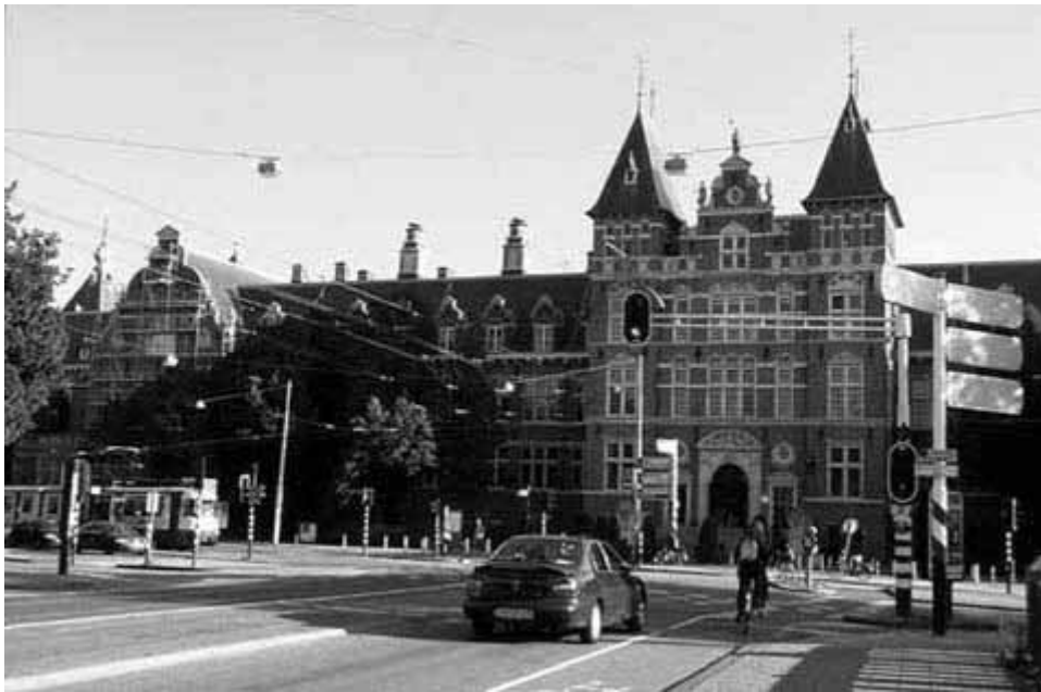
Above and below: The Tropen Institute

The Bi-Annual Meeting of the International Executive of the I.A.P. was held on the day before the Congress started. A Council Meeting was held on the morning of the first day. It is at these two meetings that the policy decisions of the I.A.P. are made. They are then presented to the formal Business Meeting which is held during the Congress itself. At each International Congress, the President of the Congress invites members of the Executives of the various Divisions to a formal dinner. On this occasion the dinner was held in the Grand Hotel close to the city centre. This building began as a monastery. It was then the headquarters of the Dutch East India Company, and then a Council chamber for the Burgomasters (Lord Mayors) of the City of Amsterdam. It is now an exclusive hotel.